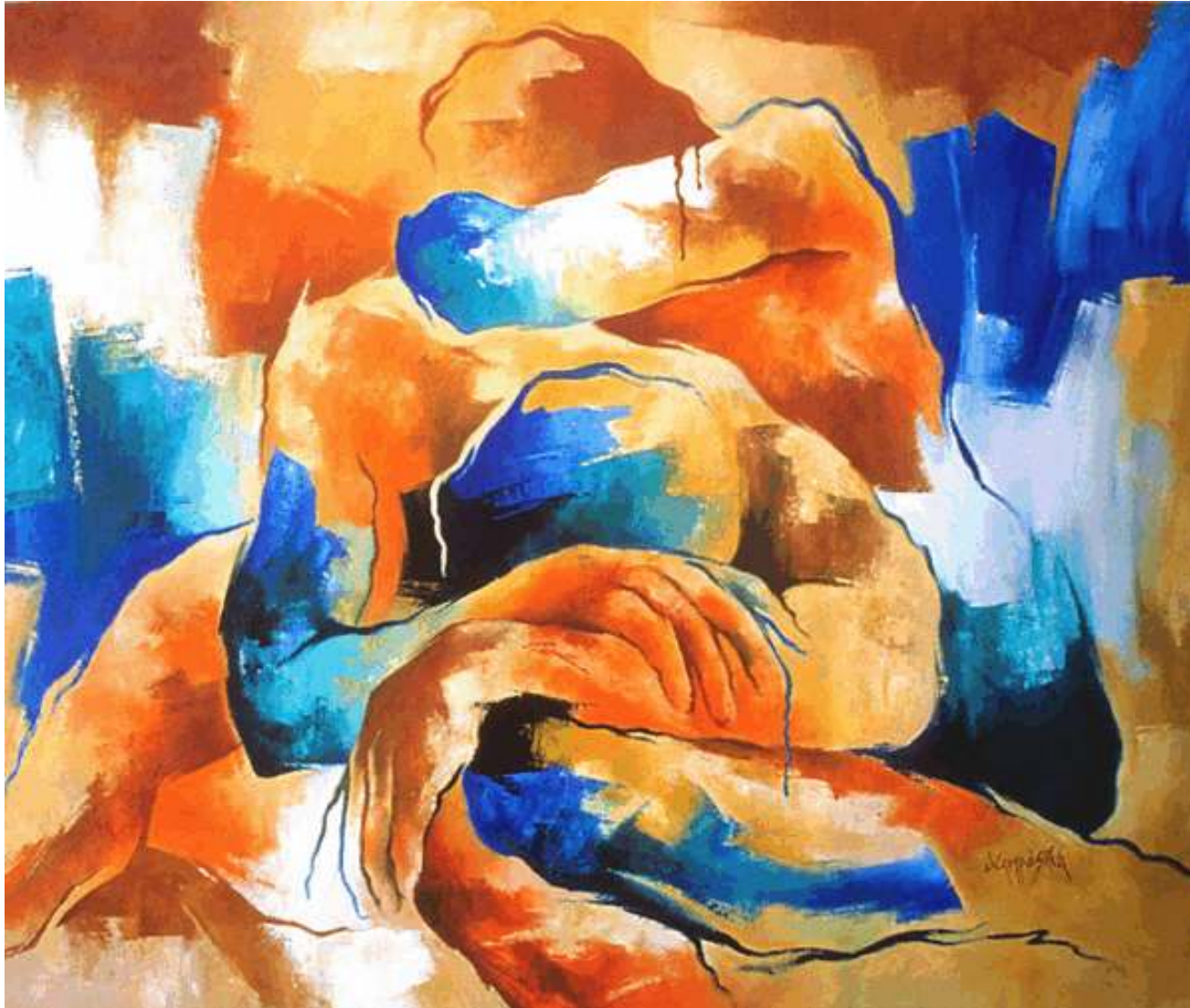
Together Forever - Acrylic on canvas

“Art is what keeps my body and soul together, my great motivation is the ethnic richness and the cultural diversity of our land. I can not imaging painting without color, my art works are a reflection of how I’d like to see my birth land, a great extension of mountains and valleys where respect for life and the human values can become almost an obsession”.